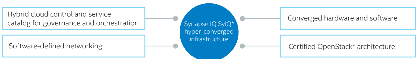
Figure 1. Synapse IQ SylQ Big Cloud in a Box* hyper-converged infrastructure provides cloud infrastructure for data center deployments